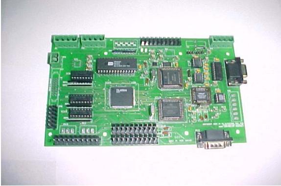
Door Controller Module